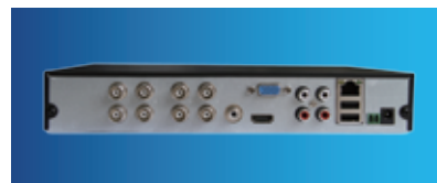
5 in 1 1080P

Mainchip:Hi3520D *4CH Audio Input,1CH Audio Output; *4ch sync playback; *Analog: 4*1080N;4*AHD-720P; Network: 4*1080P/ 720P; 8*1080P/720P; 1*1080P, Mixed: 2*AHD-720P(Analog)+2*720P(Network); *Support 1 HDD; *Power supply:12V 2A.