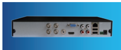
5 IN 1 1080N

Mainchip:Hi3520D *4CH Audio Input,1CH Audio Output; *4ch sync playback; *Analog: 4*1080N;4*AHD-720P; Network: 4*1080P/ 720P; 8*1080P/720P; 1*1080P, Mixed: 2*AHD-720P(Analog)+2*720P(Network); *Support 1 HDD; *Power supply:12V 2A.